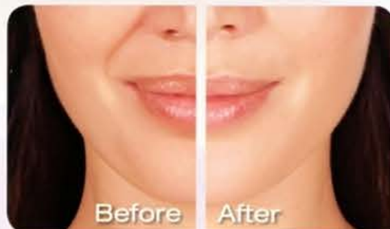
3 syringes JUVÉDERM® Ultra Plus XC (2.4 mL)

JUVÉDERM® XC lasts up to 1 year with only 1 treatment. 1,*