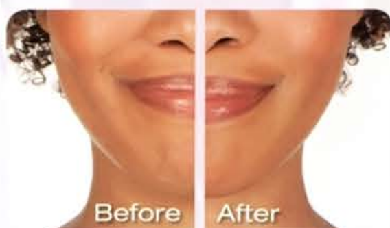
1 syringe JUVÉDERM® Ultra Plus XC (0.8 mL)

JUVÉDERM® XC injectable gel treatment is customizable to ensure smooth, natural-looking results.