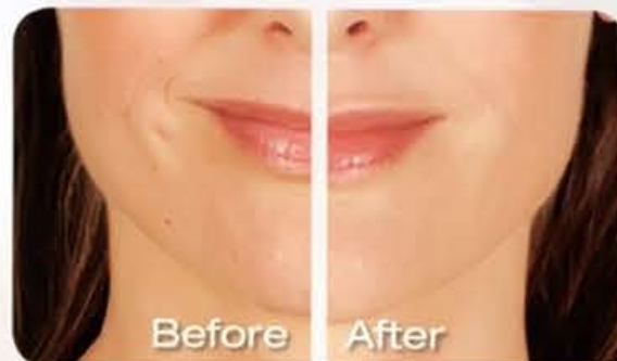
3 syringes JUVÉDERM® Ultra XC (2.4 mL)

JUVÉDERM® XC injectable gel instantly smoothes parentheses lines along the sides of your nose and mouth.